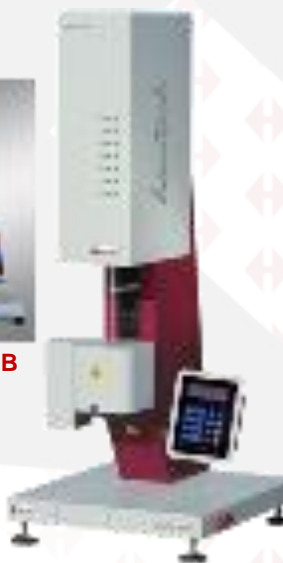
Full featured Model Method A & B + Rheology