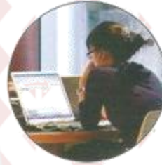
Retrofit & Computerisation