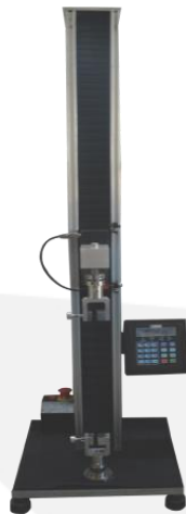
Series 7 10 to 500 Kg

hemWIZARD – WINDOWS based Software for Control & Data Acquisition