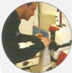
Installation & Commissioning