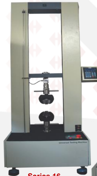
Series 16 500 to 5000 Kg