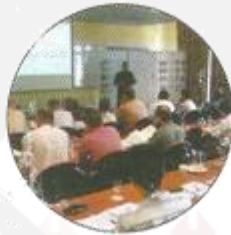
Training & Tech Support