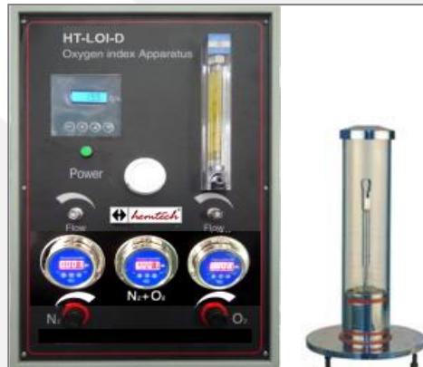
LIMITED OXYGEN INDEX