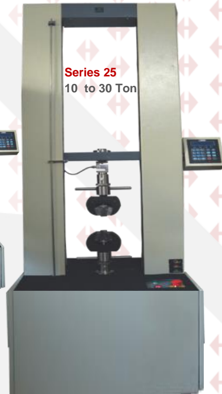
Series 25 10 to 30 Ton