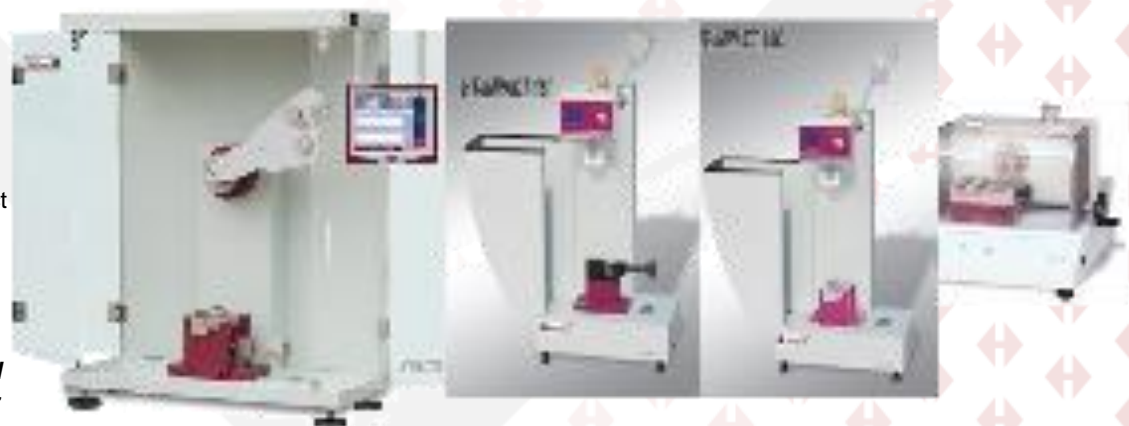
Unique Model Single Hammer Single Vice For IZOD & CHARPY

IZOD Impact Tester CHARPY Impact Tester IZOD + CHARPY Impact Tester