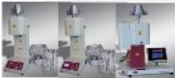
METHOD A METHOD A & B METHOD A & B Weight lifter