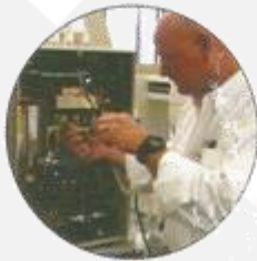
Repairs & Maintenance